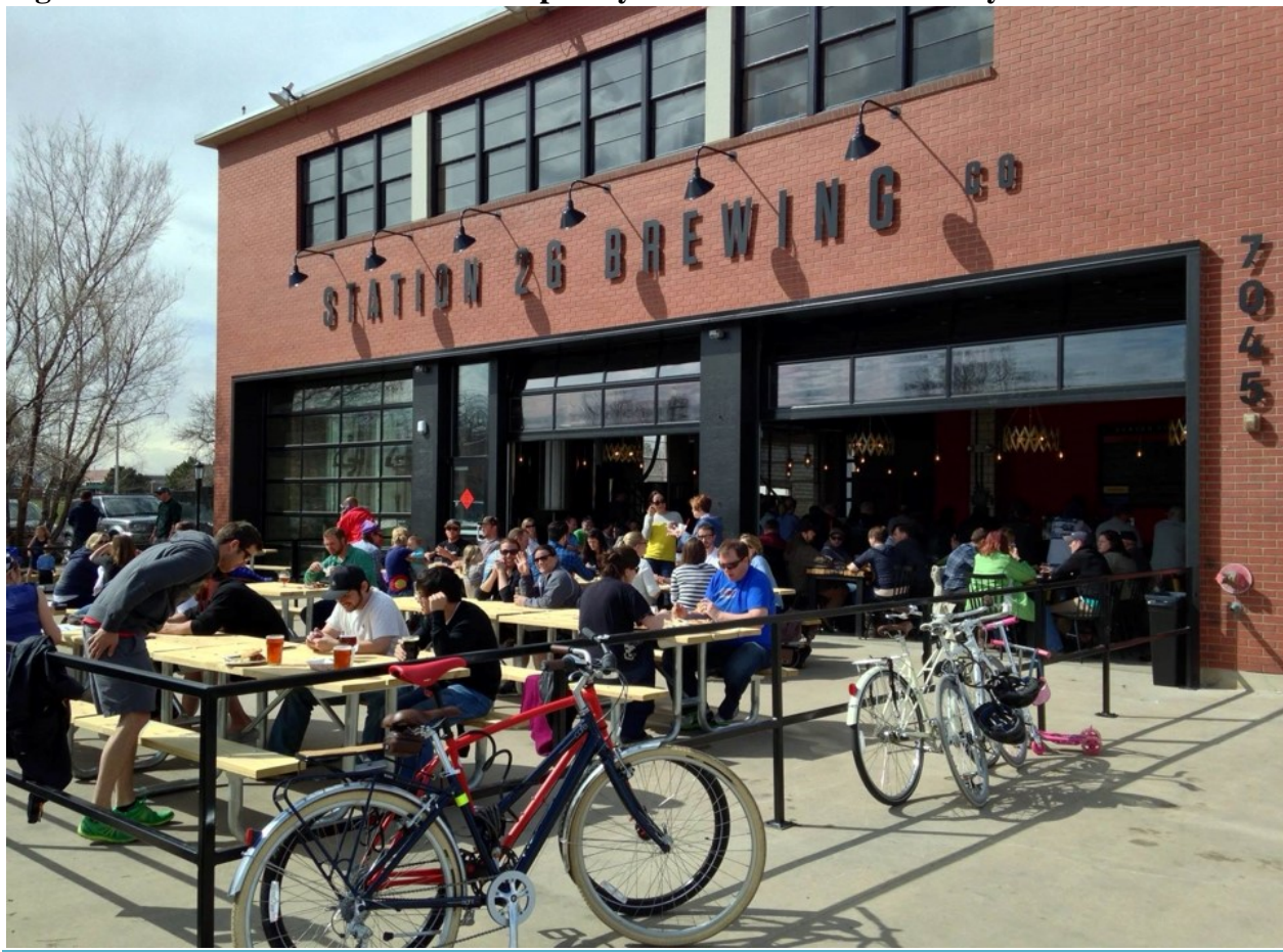
Figure 1: Exterior of a fire station adaptively reused as a microbrewery